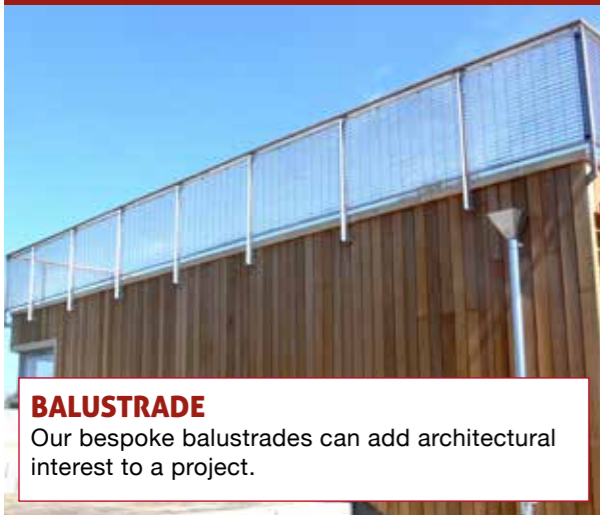
St Albans Girls School

Importantly, all our solutions are always tailored to the needs of our customers. It doesn't matter if we are working on a small residential project or a multi-million pound development, we always aim to provide solutions that meet and hopefully exceed expectations.